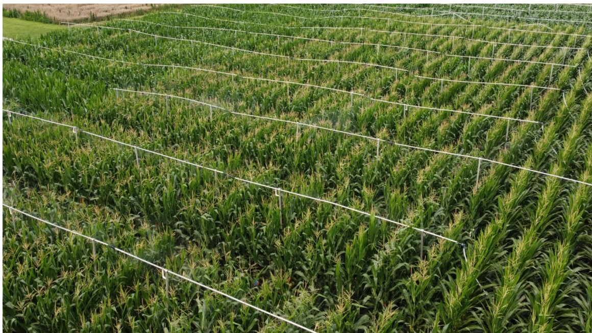
Figure 2. Overview of the OCC DON trial showing the overhead misting lines at Ridgetown.