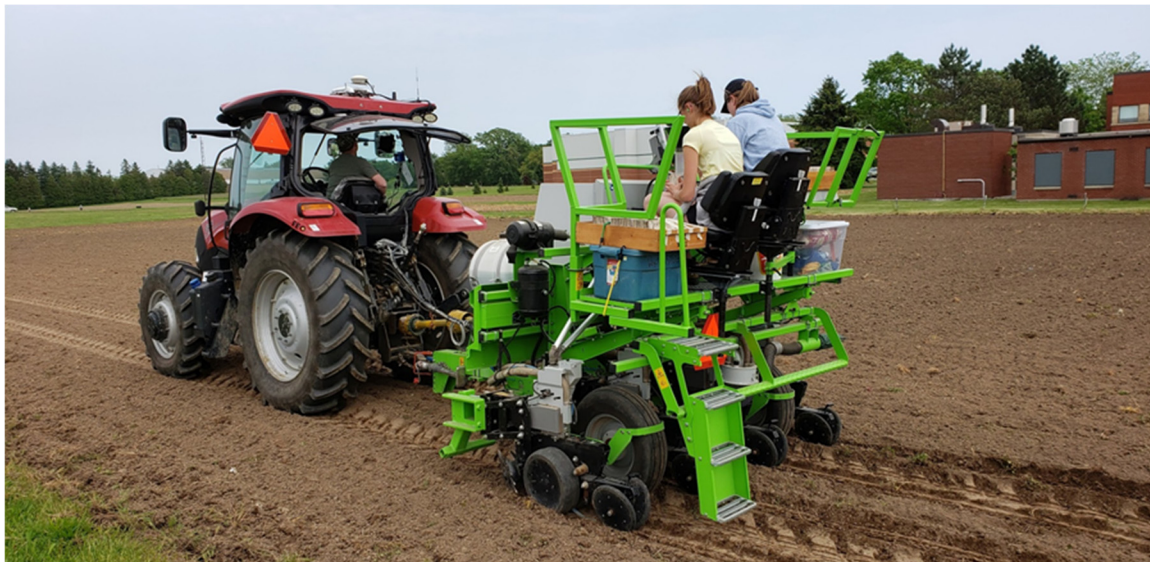
Figure 1. Precision planting the OCC DON experiment at Ridgetown.